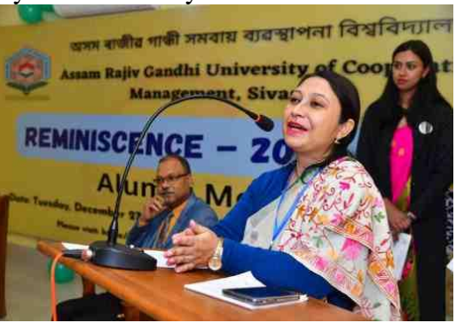
Speech of Registrar