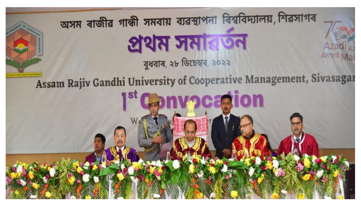
Dignitaries at the Dice