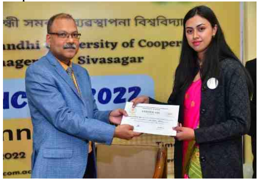
Syeda Taufiqun Nisa Memorial Award to topper (Girl) of MBA