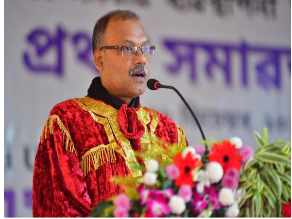
Welcome Address of Hon'ble Vice Chancellor