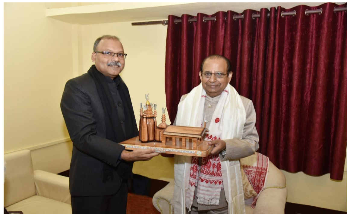
Falicitation of Hon'ble Chancelor