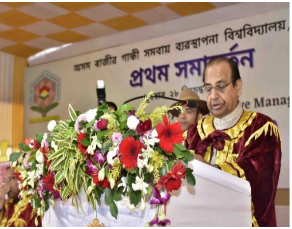
Hon'ble Chancellor's Address