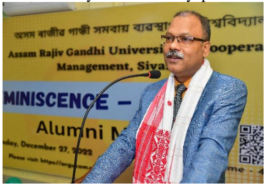
Speech of Hon'ble Vice Chancellor